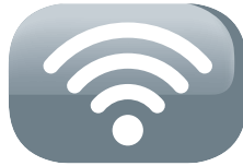
Wireless smart kit