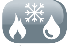
3 functions in 1