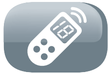
Remote control with LCD-display