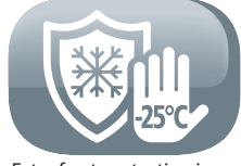
Extra frost protection in outdoor unit