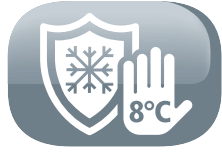
Home freezing prevention