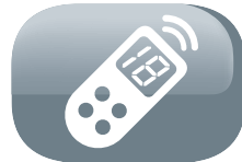
Remote control with LCD-display