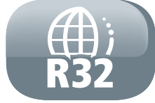
Environmental friendly refrigerant