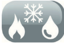
3 functions in 1